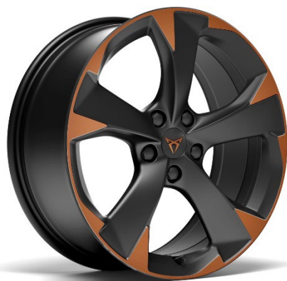
18" Machined Copper