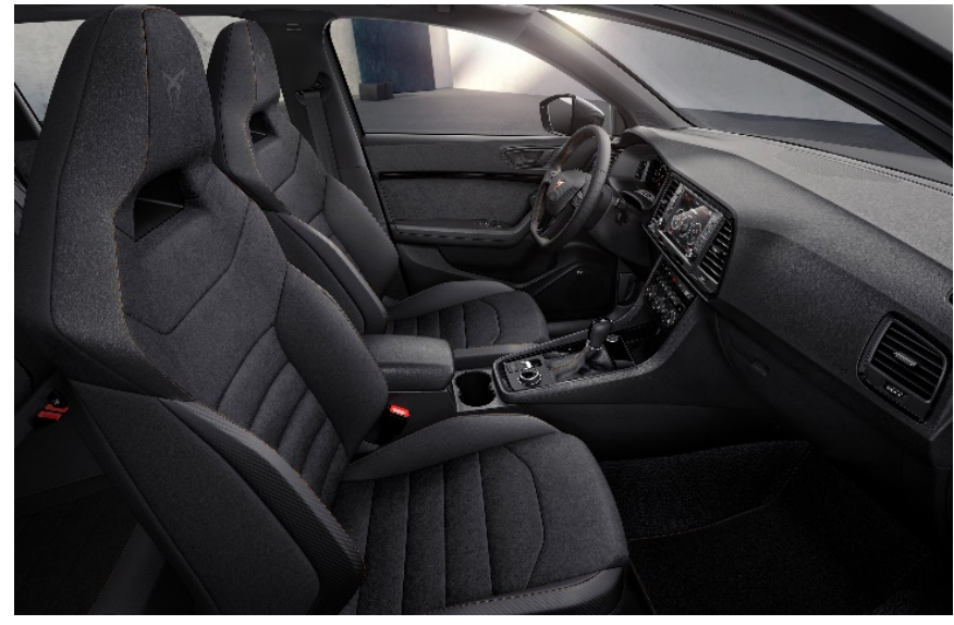
Bucket Seats – Available in Alcantara