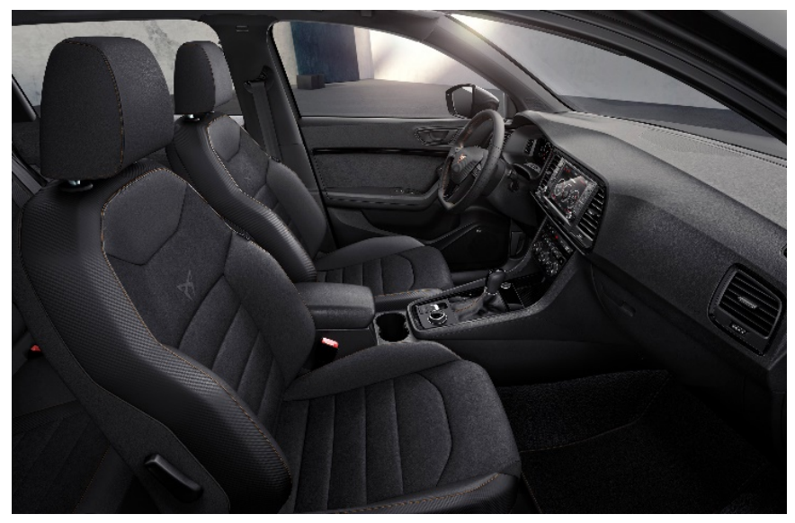
Standard Seats - Available in Alcantara and Leather