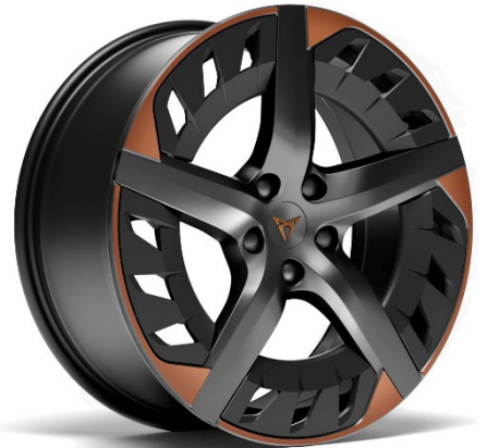
19" Machined Copper Aero