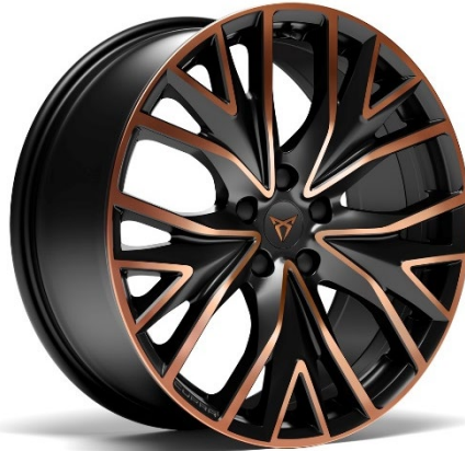
19" Performance Copper