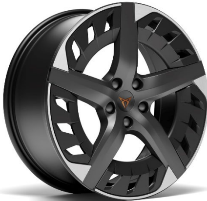
19" Machined Aero