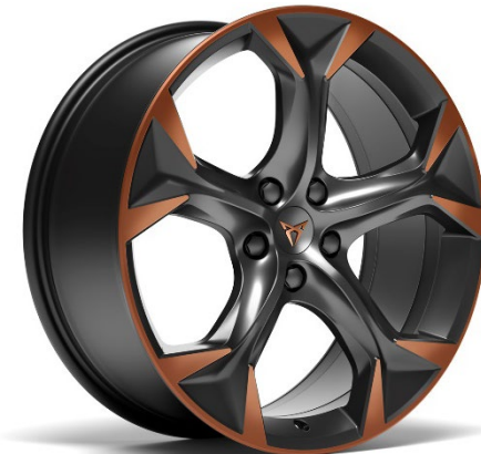
19" Machined Copper