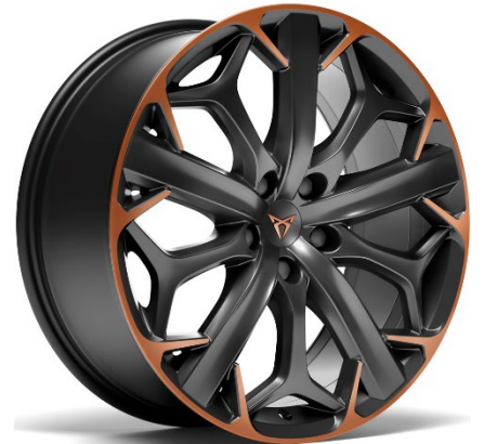
19" Machined Copper II