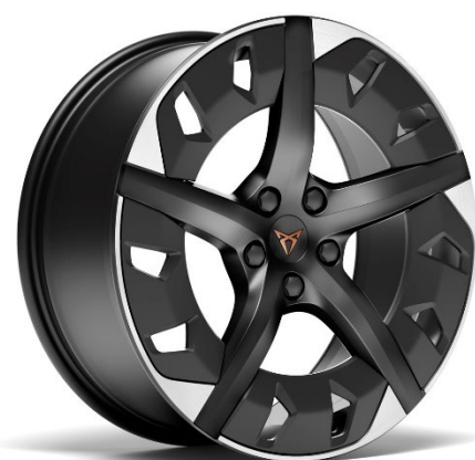
19" Machined Aero