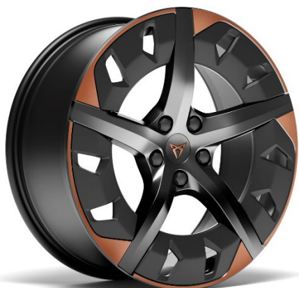
19" Machined Copper Aero