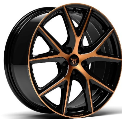
19" Machined R Copper