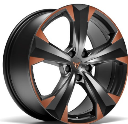
19" Machined Sport Copper