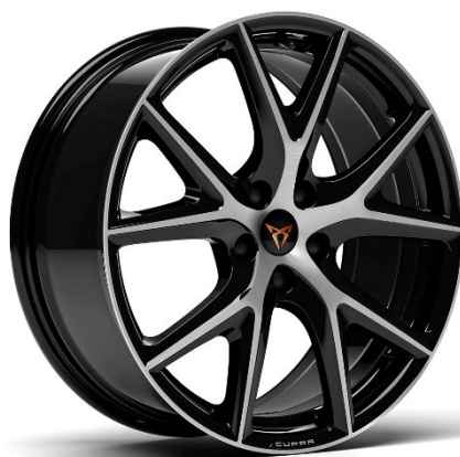
19" Machined R Silver