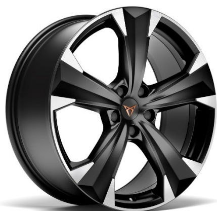
19" Machined Sport Silver