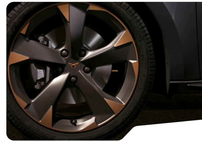
↑ 18" ALLOY SPORT BLACK AND COPPER L