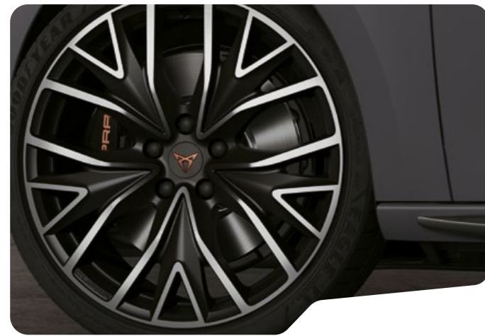
↑ 19" PERFORMANCE SPORT BLACK AND SILVER VZ

CUPRA Leon L CUPRA Leon VZ VZ CUPRA Leon VZ CUP VZ CUP Standard ■ Optional ■