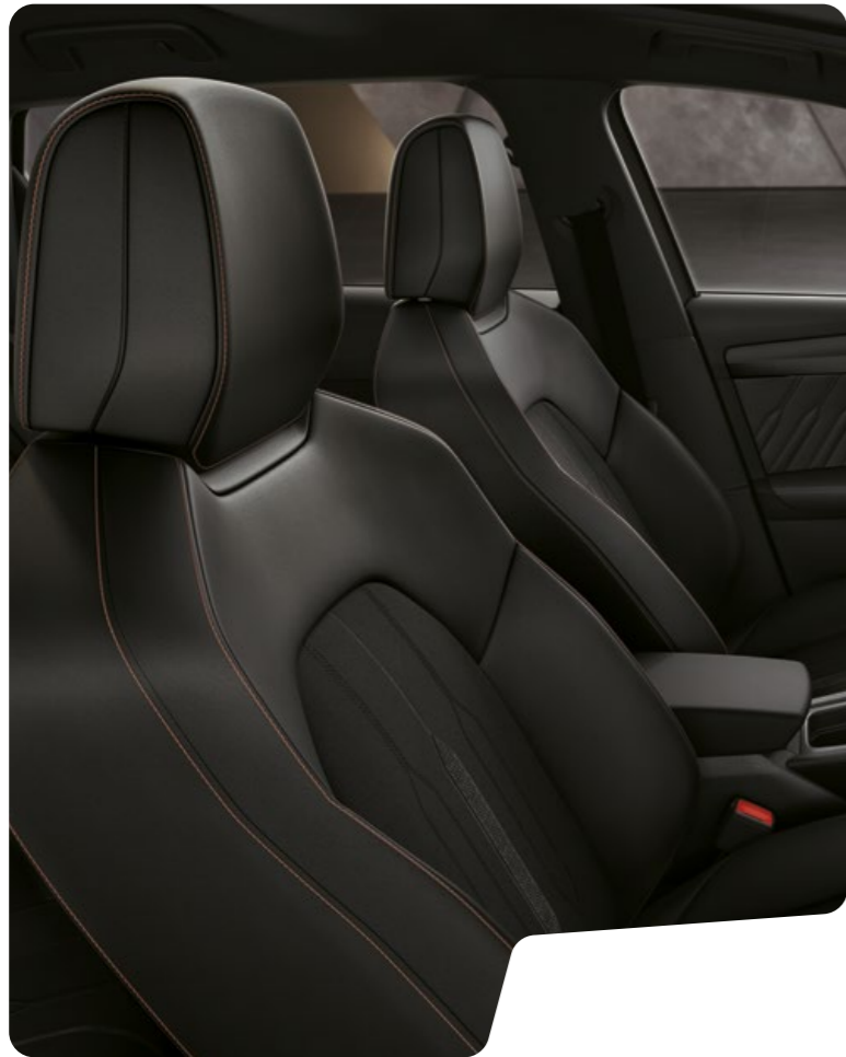
↑ TEXTILE SHARP SPORT SEATS L