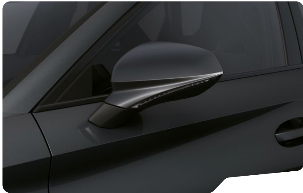
↓ MAGNETIC TECH 2