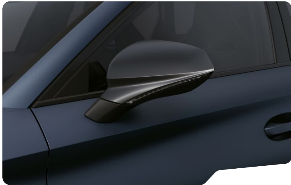
↓ PETROL BLUE MATTE 4