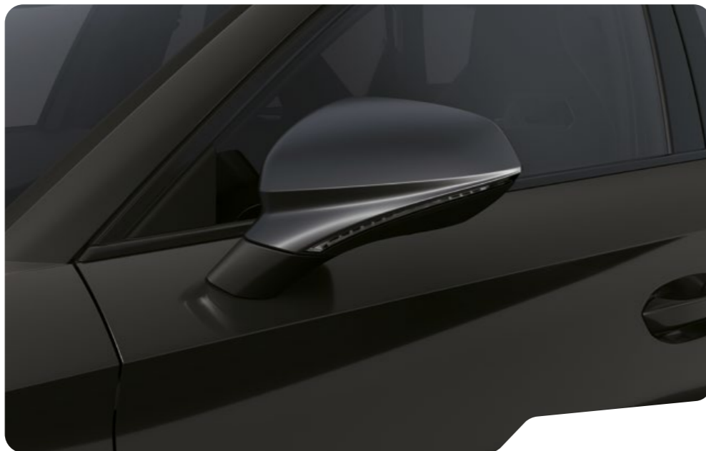
↓ MIDNIGHT BLACK 2