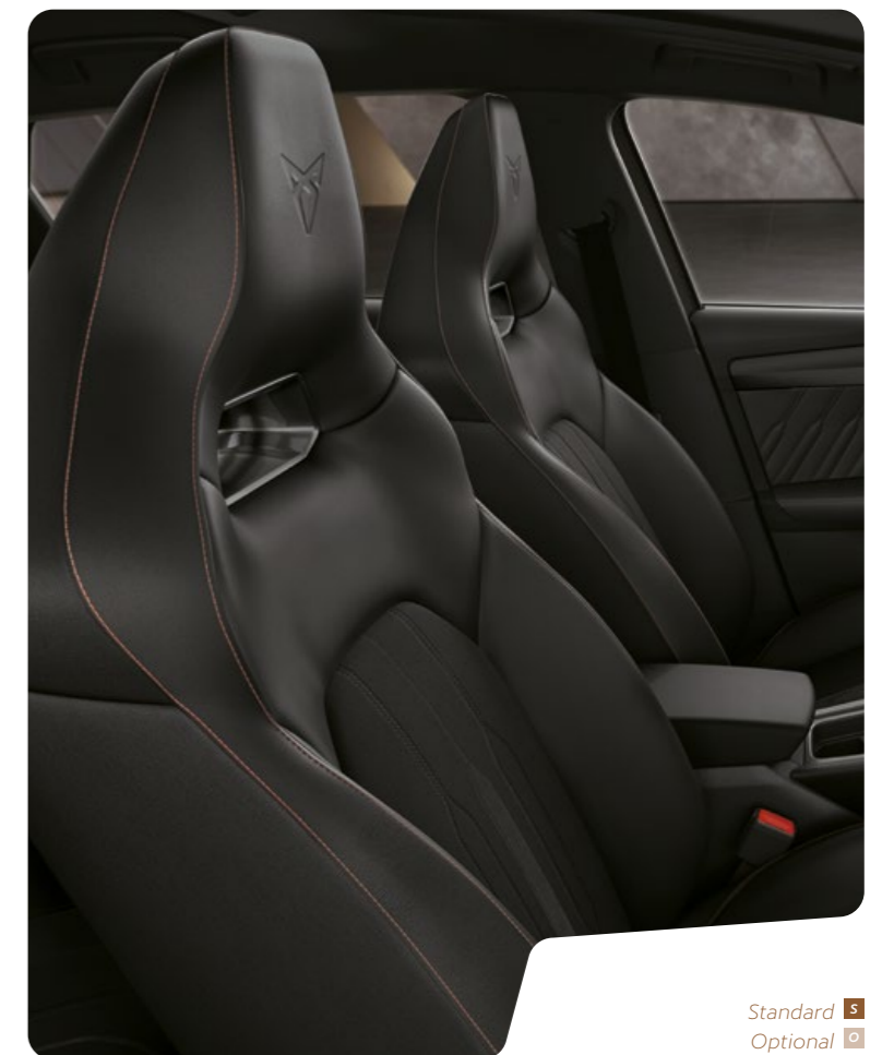
→ TEXTILE SHARP BUCKET VZ L

CUPRA Leon L CUPRA Leon VZ VZ CUPRA Leon VZ CUP VZ CUP Standard S Optional O