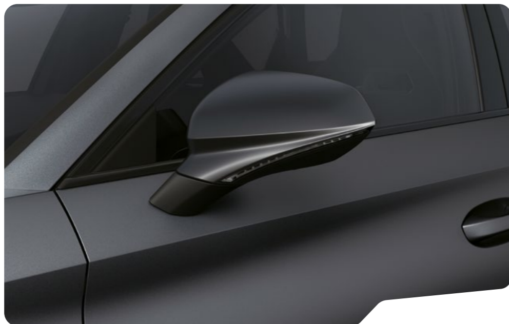
↓ MAGNETIC TECH MATTE 4