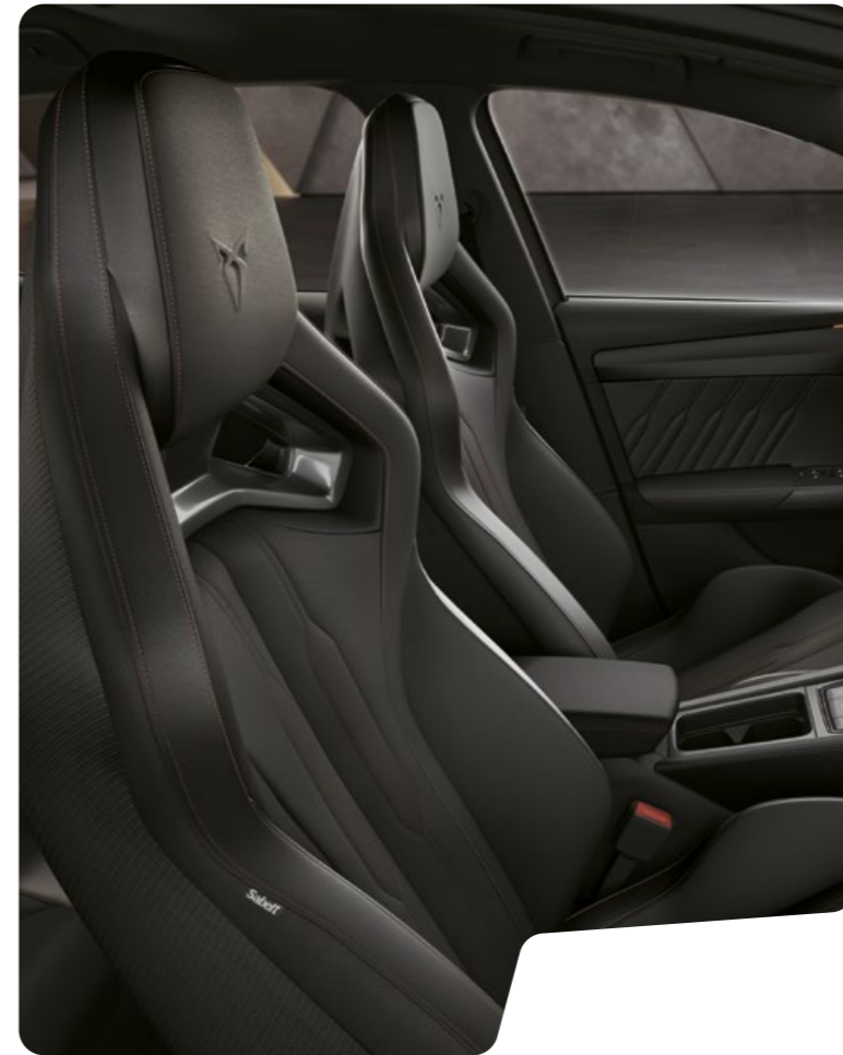
← GENUINE BLACK LEATHER CUP BUCKET 1 VZ CUP

CUPRA Leon L CUPRA Leon VZ VZ CUPRA Leon VZ CUP VZ CUP