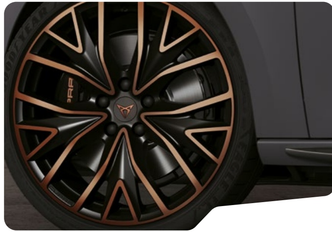
↑ 19" PERFORMANCE SPORT BLACK AND COPPER VZ CUP VZ