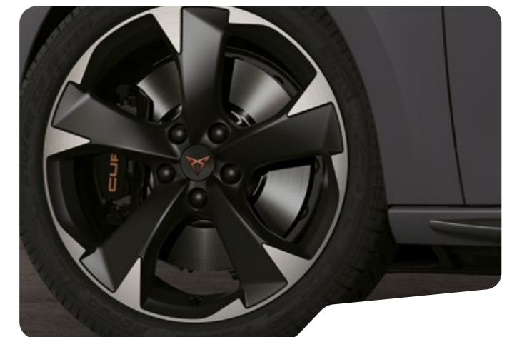
↓ 18" ALLOY SPORT BLACK AND SILVER L

*18" Alloy wheels in Sport Black and Copper also include: Midnight Black roof spoiler, Dark Aluminium pedals and side skirt (depending on engine). Black Interior roof recommended. These wheels will be available with e-HYBRID 204HP engine from w.02/23. Review Design pack configuration (page 74-75).