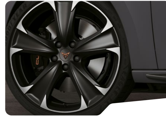
→ 19" ALLOY SPORT BLACK AND SILVER VZ