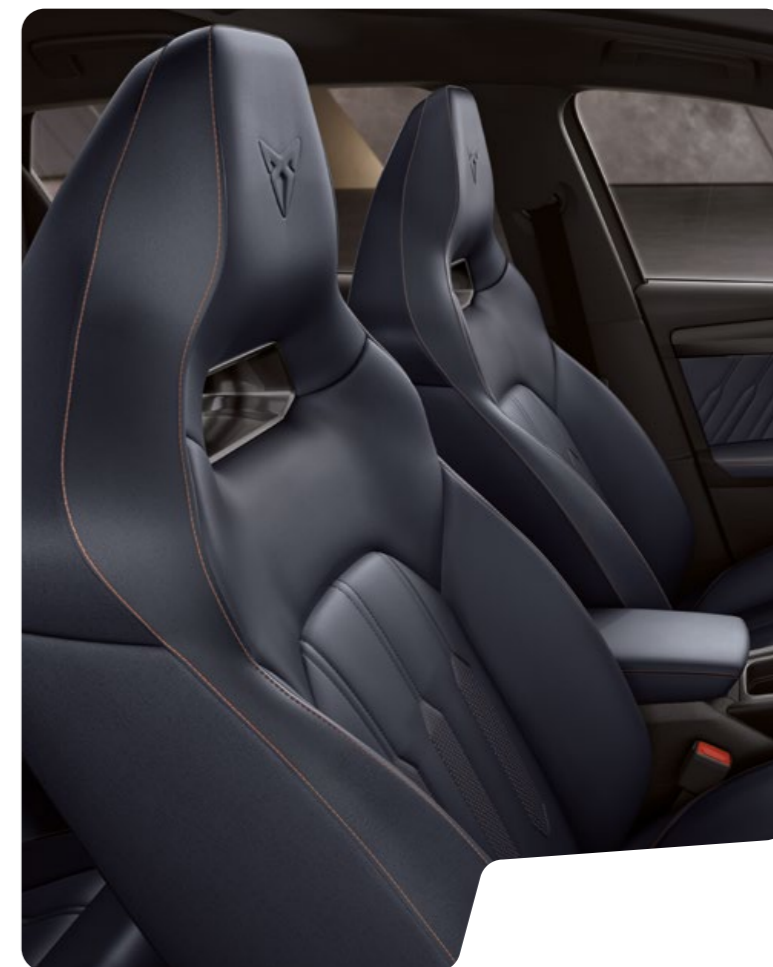
→ GENUINE PETROL BLUE LEATHER BUCKET L VZ

Our global range of cars and product specifications varies from country to country. Please, visit your local CUPRA website to know more about the product offer available for you.