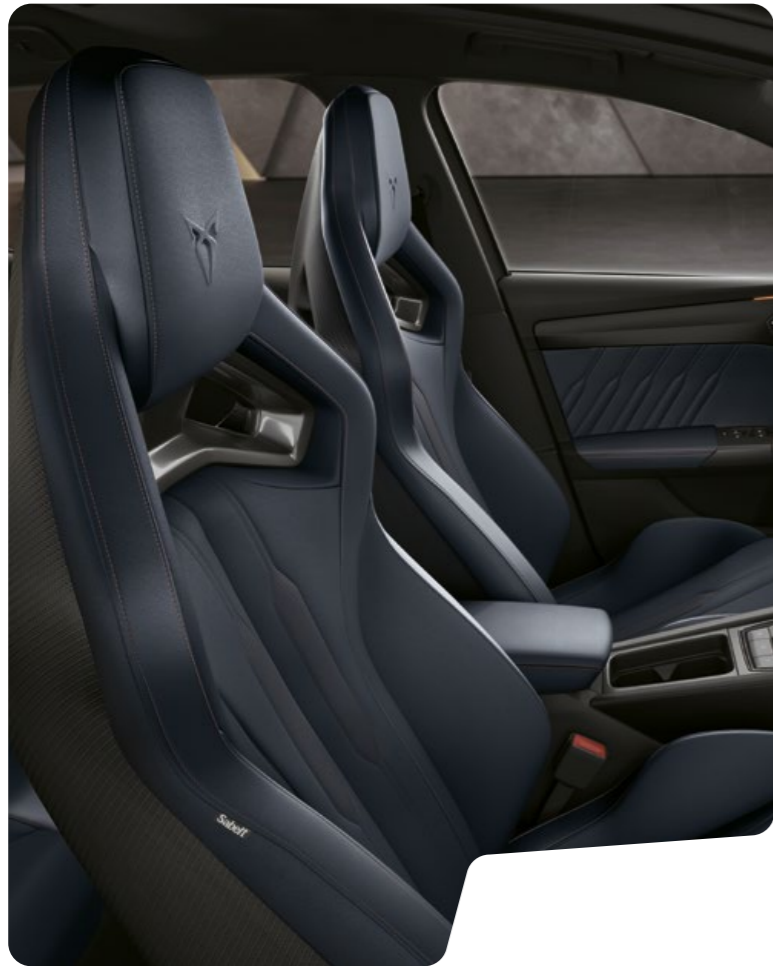
↑ GENUINE PETROL BLUE LEATHER CUP BUCKET 1 VZ CUP