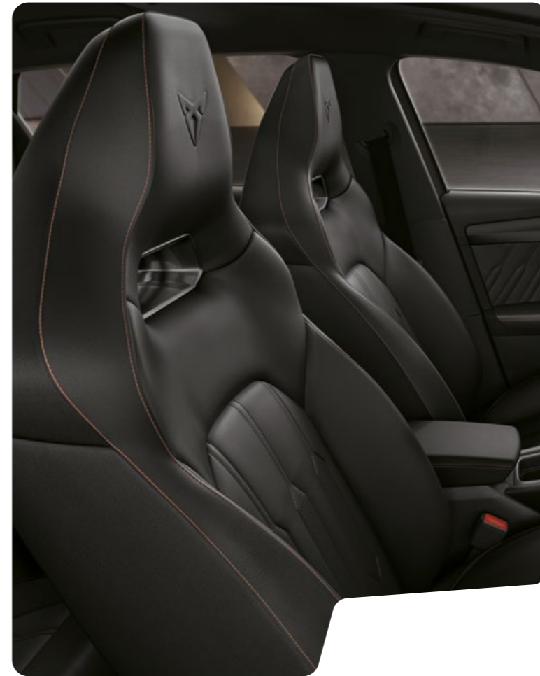
← GENUINE BLACK LEATHER BUCKET L VZ