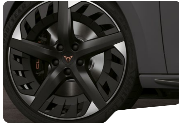
↓ 19" AERO SPORT BLACK AND COPPER 1 VZ